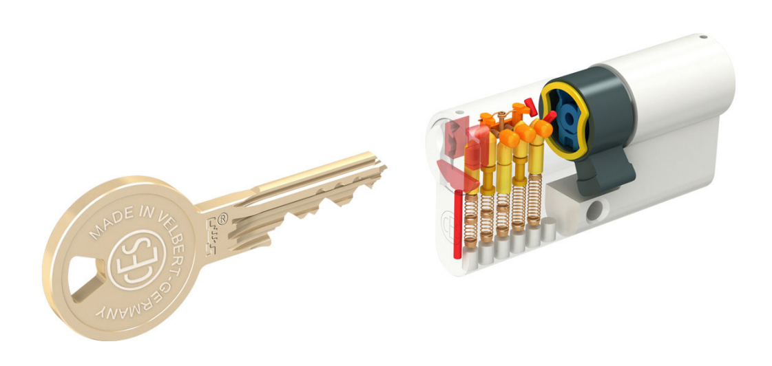
Fig. 1: new VdS-recognised CES security cylinder (available as of 1 January 2019)