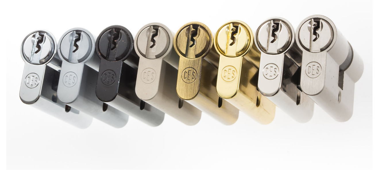
Fig. 3: a selection of possible colours for locking cylinders and locks